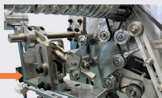
[Auto cutting device]