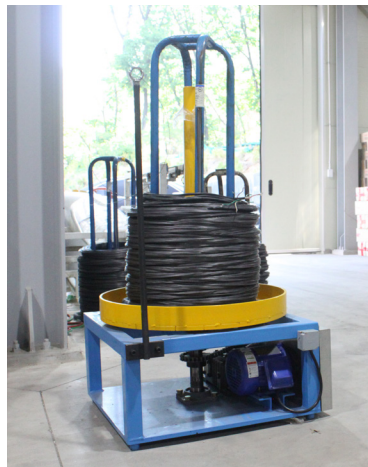
[Spring steel wire unwinder]